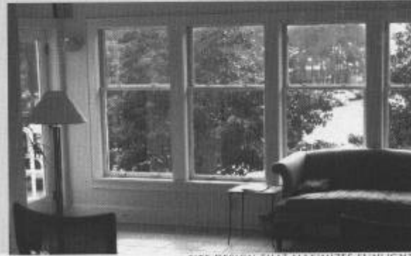
SITE DESIGN THAT MAXIMIZES SUNLIGHT

The MID team is working at the site scale, with buildings and grounds; the community scale, with neighborhoods and municipalities; and at the landscape scale, with regions and the state, to promote good development as New Hampshire grows. This issue of New Hampshire Audubon focuses on concepts and activities primarily at the community and landscape scales.