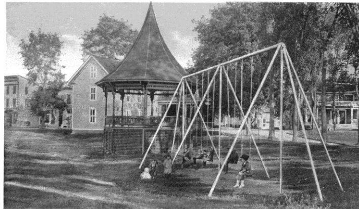
CHILDREN'S PLAY GROUNDS, BELMONT, N. H.