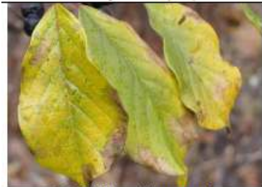
Fall foliage (Autumn)