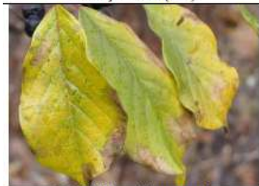
Fall foliage (Autumn)