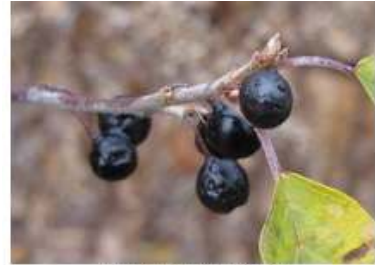
Fleshy fruits (fall)

In the summers of 2011 & 2012 the BCC paid for crews from the Student Conservation Association (SCA) to hand pull G. Buckthorn with a grant from the Aquatic Resource Mitigation program. This year during a follow-up walk with NH Dept. of Environmental Services (DES) we discovered that previously cleared areas had resprouted. This effort will follow up to revisit previously cleared areas and attack new ones if time allows. The suggestion was made by DES that the BCC host an annual cleanup of the property.