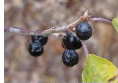
Fleshy fruits (fall)

In the summers of 2011 & 2012 the BCC paid for crews from the Student Conservation Association (SCA) to hand pull G. Buckthorn with a grant from the Aquatic Resource Mitigation program. This year during a follow-up walk with NH Dept. of Environmental Services (DES) we discovered that previously cleared areas had resprouted. This effort will follow up to revisit previously cleared areas and attack new ones if time allows. The suggestion was made by DES that the BCC host an annual cleanup of the property.