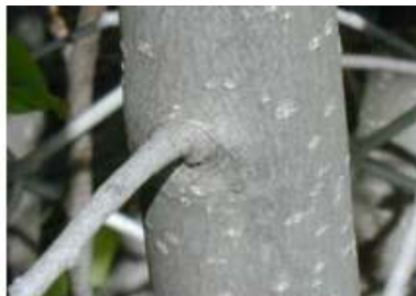
Gray bark w/ lenticels (Summer)

By volunteering, you will help us achieve the restoration of this extremely significant wildlife habitat - the infested upland supports one of the most highly ranked wildlife habitats in the state - the Tioga Marsh!