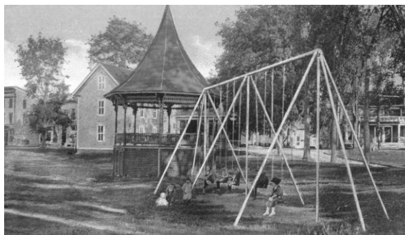
Village -1920s Postcard