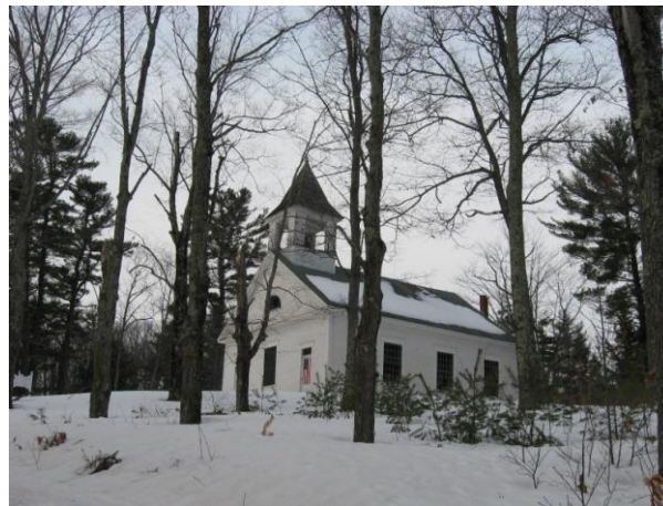
Province Road Meeting House – Built 1792