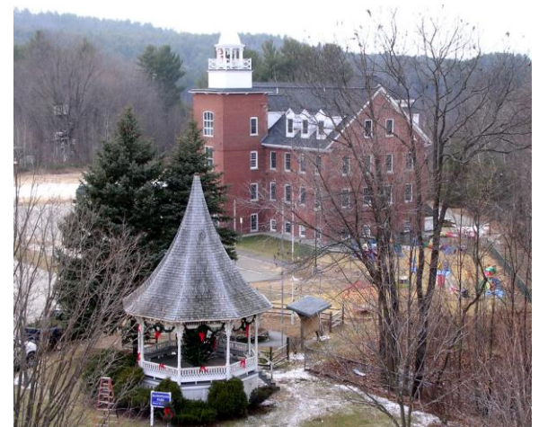
Bandstand & Mill