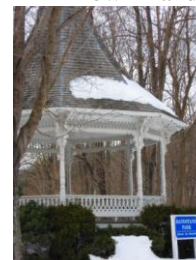
Town Bandstand - Built 1908

October 24: Help us again on " Make A Difference Day " to continue Province Road Meeting House landscaping improvements. Donations of daffodils are most welcome. Route 107-Province Road, 9:30AM – 12noon