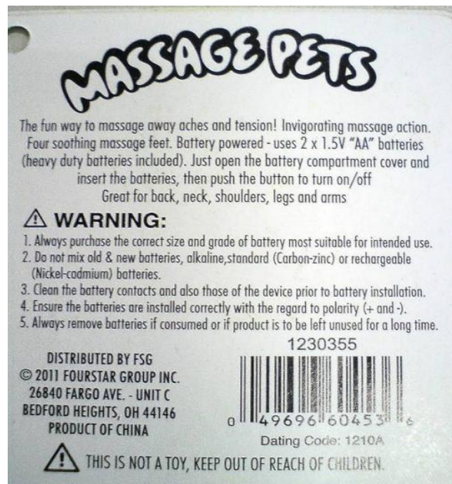
Back of ladybug hangtag