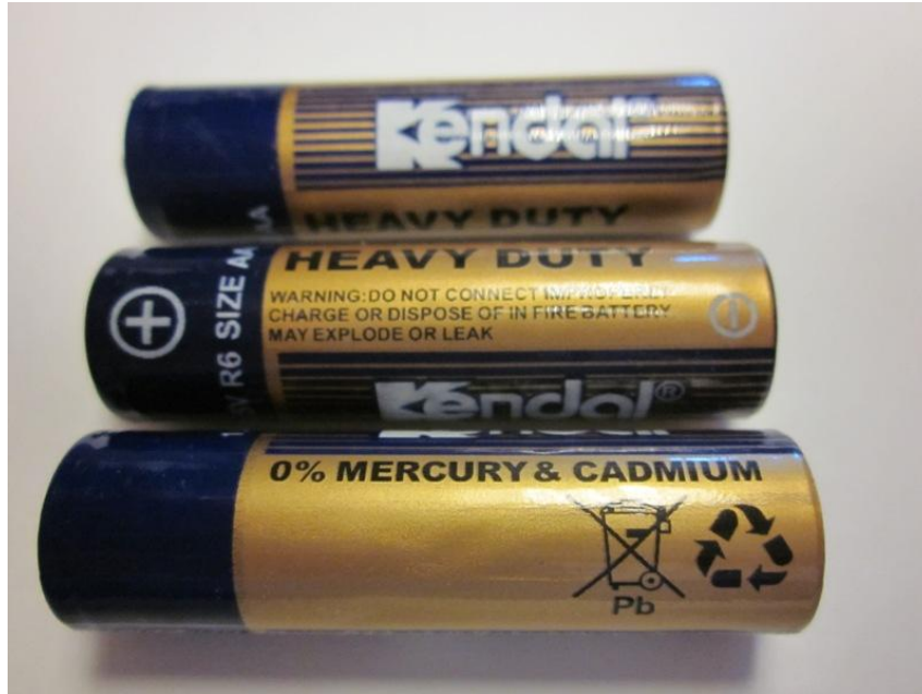
Kendal batteries sold with the product