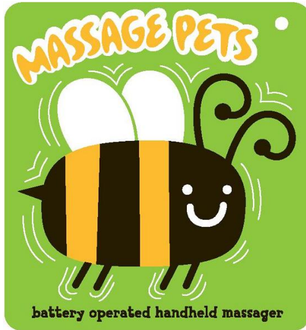
Front of bee hangtag