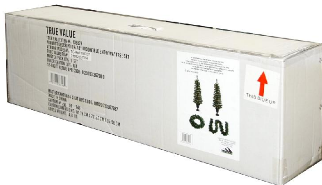
Picture of Recalled Tree, Wreath and Garland Set Packaging Labeling