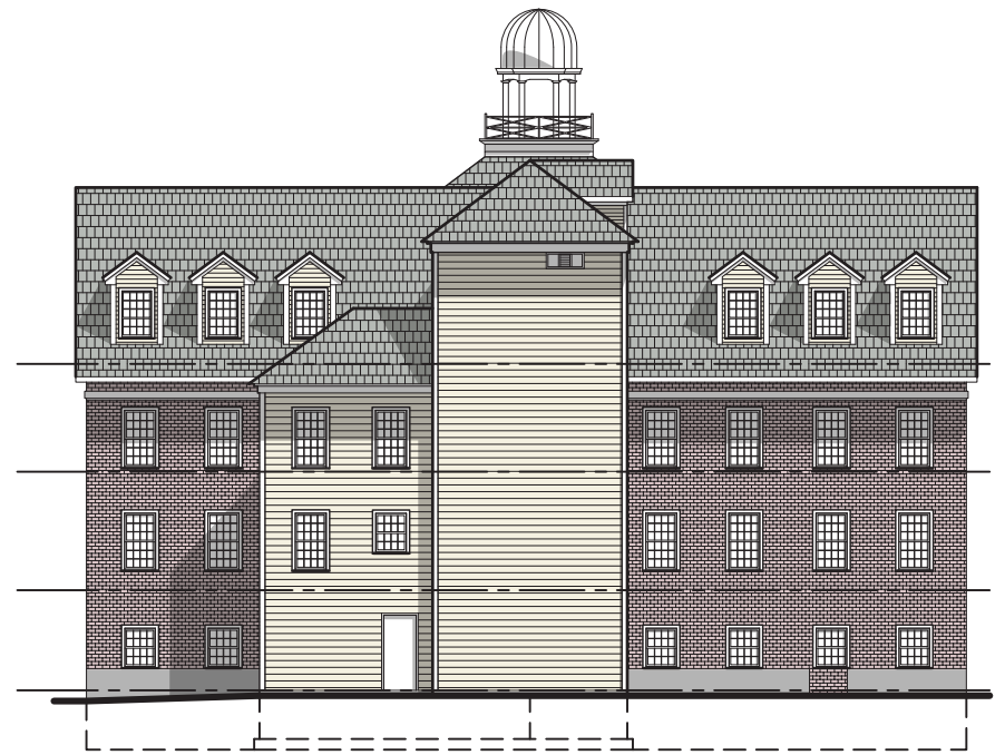
3 WEST ELEVATION RHS