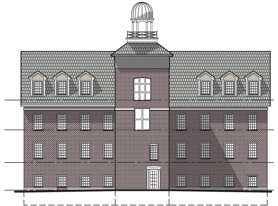
1 EAST ELEVATION RHS