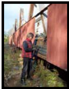
A Pictorial of the Dover Bridge Relocation