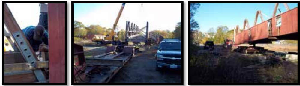
A Pictorial of the Dover Bridge Relocation