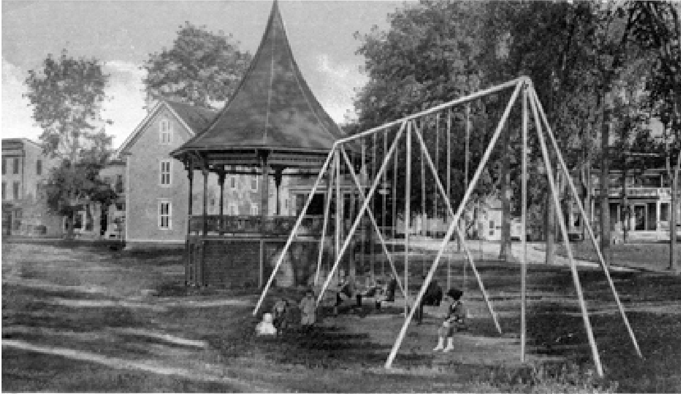
CHILDREN'S PLAY GROUNDS, BELMONT, N. H.