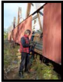
A Pictorial of the Dover Bridge Relocation