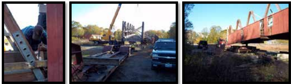
A Pictorial of the Dover Bridge Relocation