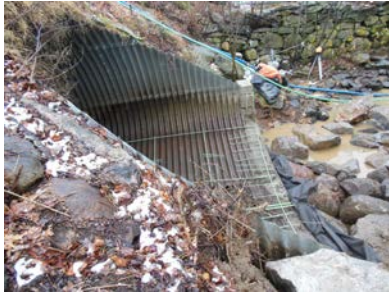
Church Street Bridge October 2012