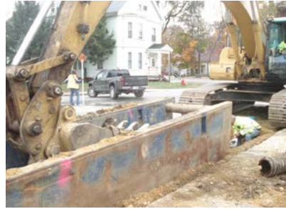
Main Street Waterline Replacement Summer 2012