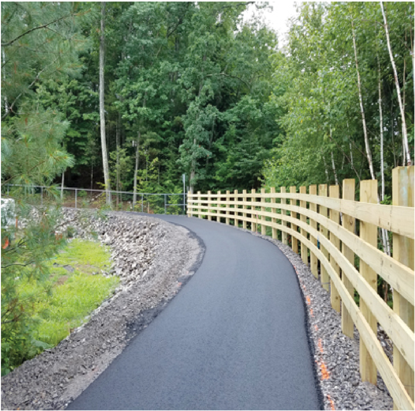
The Laconia Daily Sun - All Rights Reserved